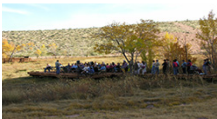
Fall is Landing