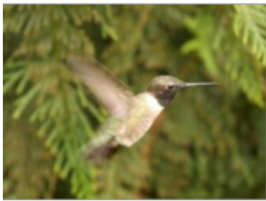
Black chinned Hummingbird